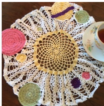
Solar System Doily by Miss Zdrojewski